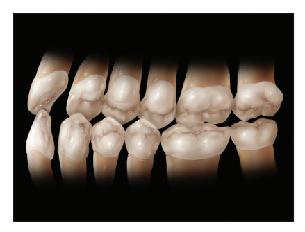
Figure 2. Correct lateral anterior guidance should exhibit no posterior contacts during excursive movements.