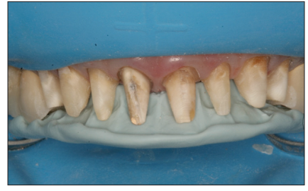
Figure 7. Preparation reduction guides are created from the diagnostic wax up and ensure the reduction goals are met.